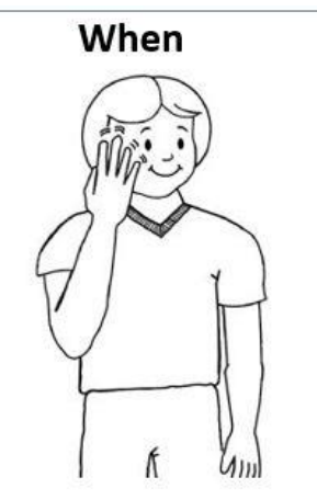
How to sign it: With fingers spread, pointing up, tap them on cheek one after the other.

little fingers extended outwards from sideways, palm down fist, move hand left and right twice.